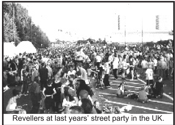
Revellers at last years' street party in the UK.