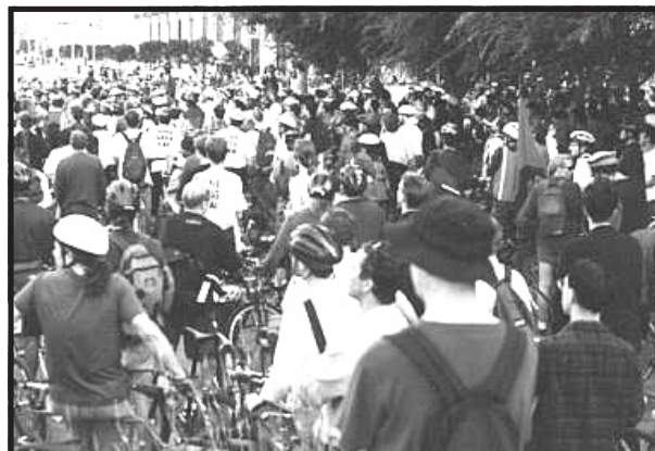
Frustrated cyclists wait until traffic clears behind the motorists' "Mass".

She also questions the attitude of some of the motorists involved in the drive. "They grimace at you from behind their windshields. They're always butting into traffic illegally, and in some cases are obviously trying to intimidate other road users."